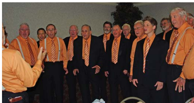
Warming Up for Contest