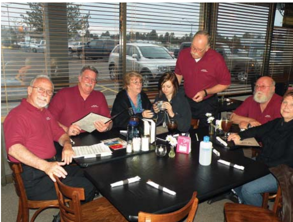
The “crowd” included many chorus and quar- tet members