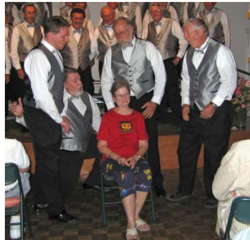
Crook's Trail Quartet